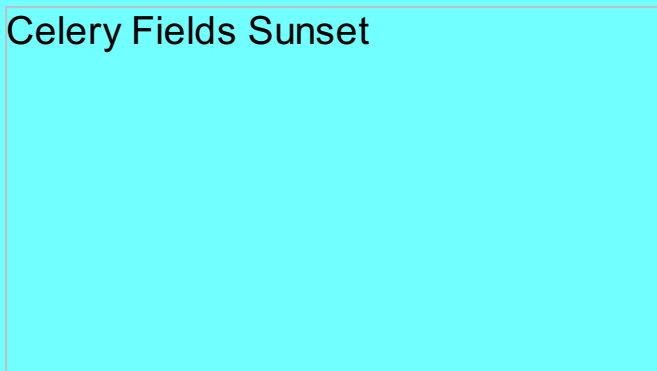
Sunset at the Celery Fields