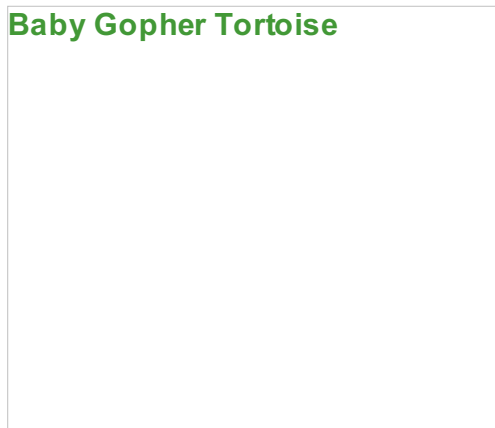
Baby Gopher Tortoise

"The red-shouldered hawk chicks (2) have fledged, so the bridge has been reopened. The chicks are still hanging around begging for food from the parents (typical "teenagers"). We lost our sandhill crane chick-not sure how. The parents have moved on, but at least the male is no longer attacking the cars in the parking lot! Two bobcats and numerous gopher tortoises have been spotted here as well as many other turtles and birds. The park is humming with life!"