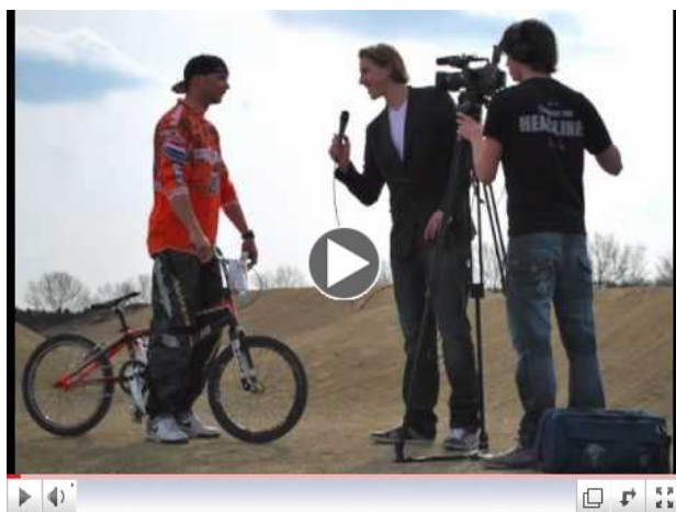
S.I.G.N.bmx crossroads to London Olympics 2012